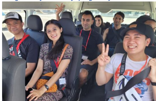
Image: Seafarers enjoying our free bus

After the challenges of Covid-19 lockdowns, we are continuing to offer seafarers hope and rejuvenation through restoring our past services and maintaining popular ones started during covid. Our financial and volunteer support levels have not yet returned to pre-pandemic levels, but we have returned to full staffing. We continue to be grateful for our blessings and present to you this Impact summary: