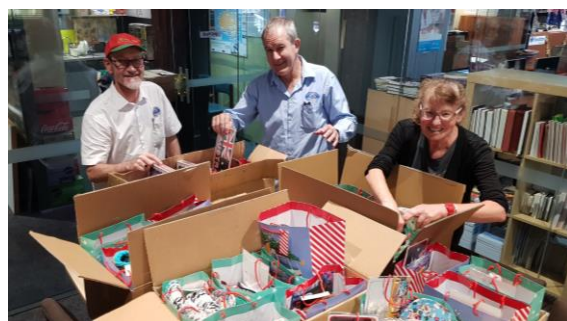
Bringing Smiles to Seafarers – the MtS Syd team packing gift bags

https://www.missiontoseafarers.org/news/2022-a-year-of-recovery-for-seafarer-welfare-with-happiness-rising-across-the-board-says-latest-seafarers-happiness-index